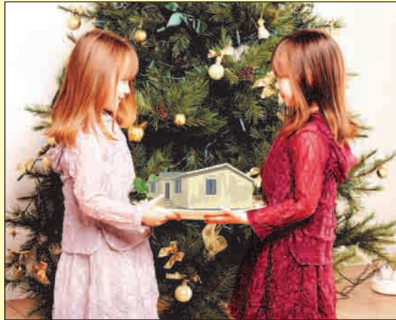
Give your children the stability and future security of their own home!

“Home prices are near historic lows! Interest rates are down to levels we have not seen for a long time, and falling. The government is talking about a 4.5% loan for new homebuyers! There is a ton of inventory available to choose from. The Federal Housing Administration (FHA) is promoting home ownership with zero down for qualified customers! It’s Crazy” he quipped!