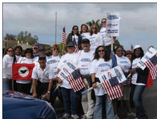
Cesar Chavez Parade Saturday, March 29, 2008