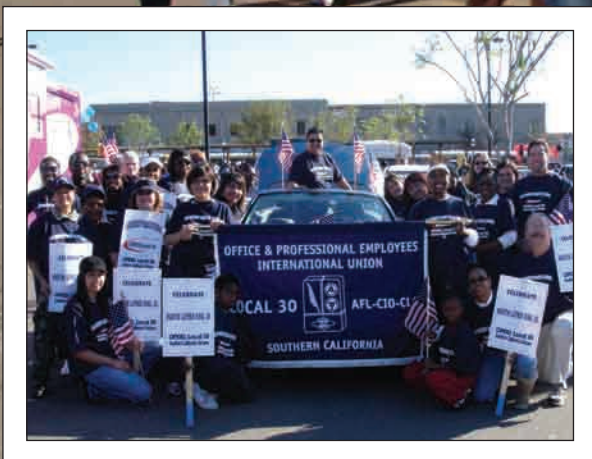
Martin Luther King Parade January 19, 2008